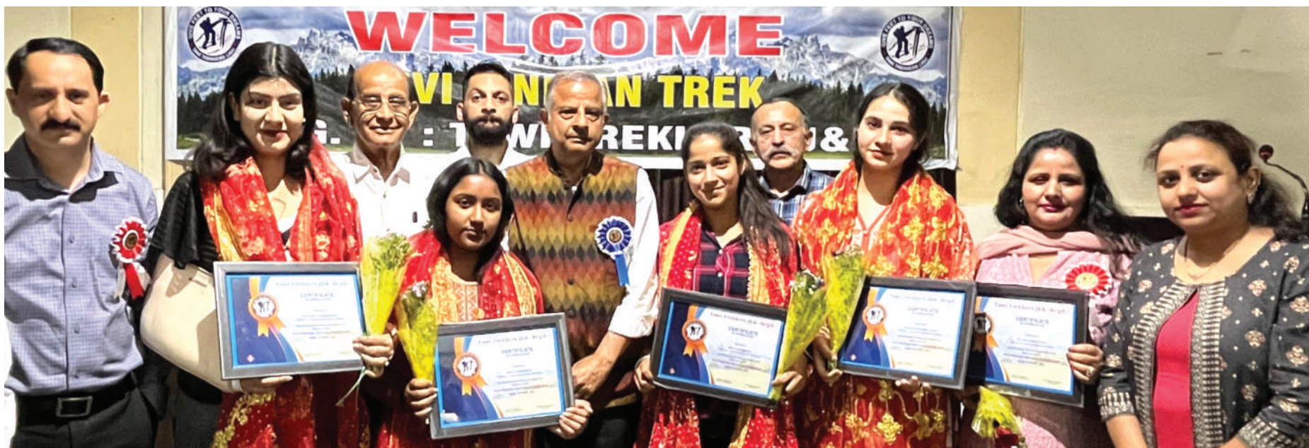
Awardees of Devi Pindian Trekking Programme with the dignitaries.